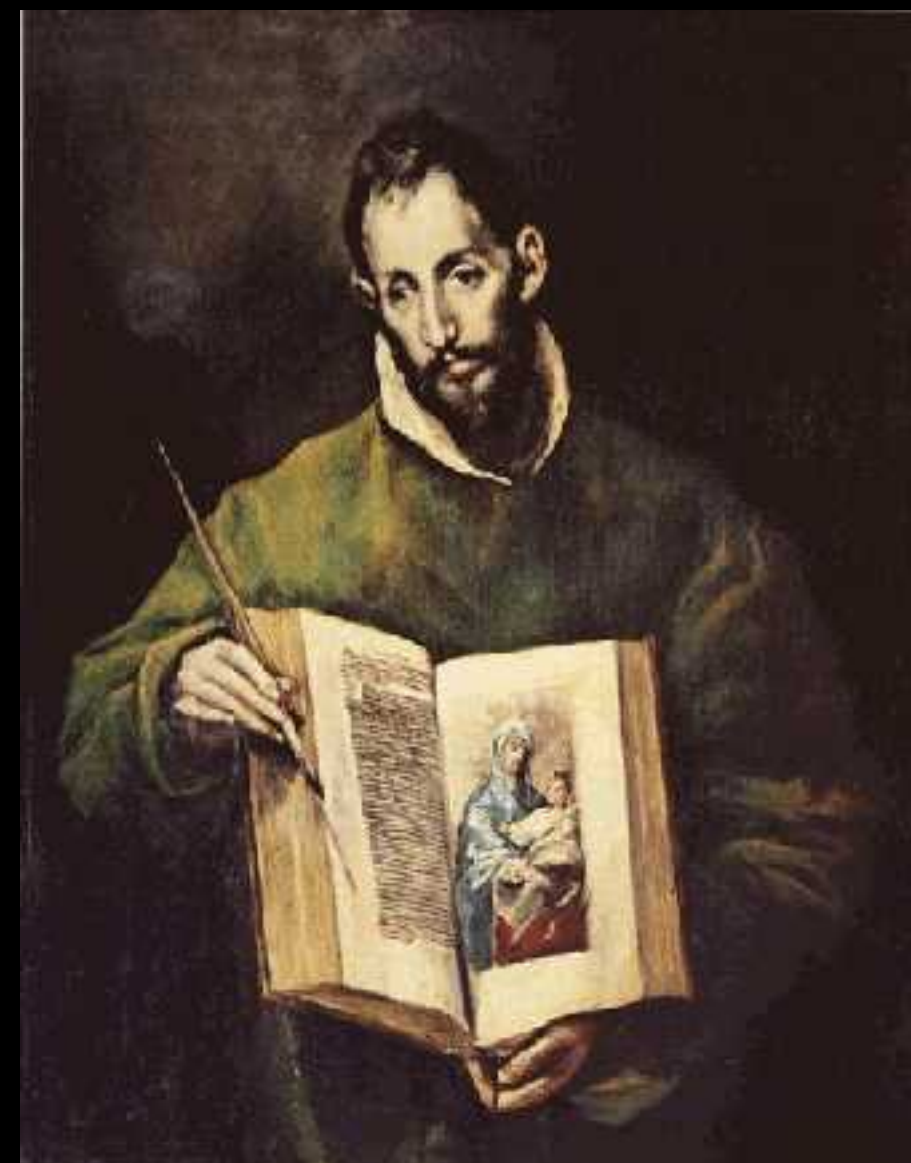
El Greco. St. Luke . c. 1605-1610