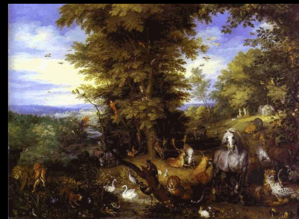
Jan Brueghel the Elder. Adam and Eve in the Garden of Eden . 1615.